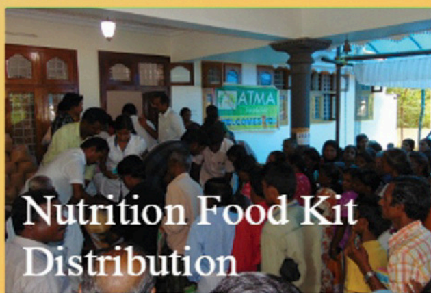
Nutrition Food Kit Distribution