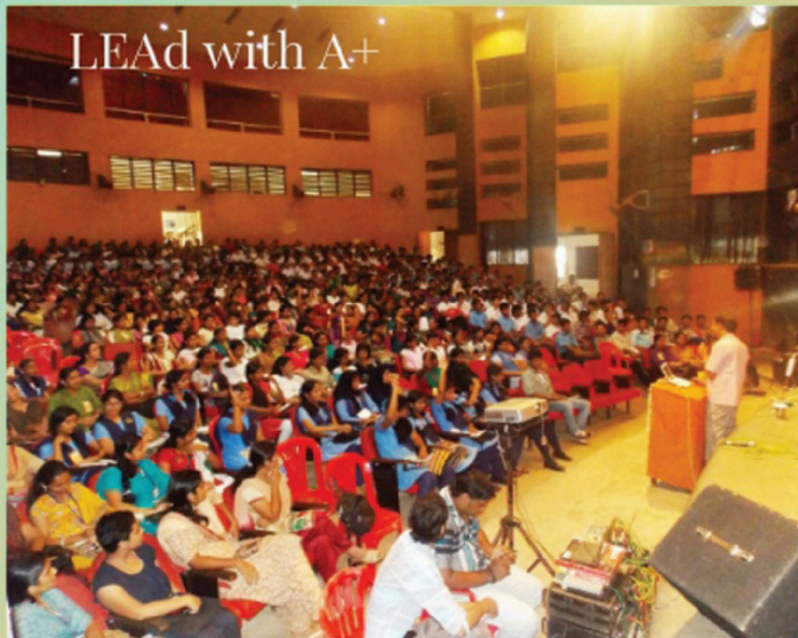
LEAd with A+