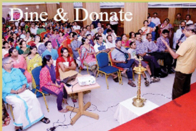
Dine & Donate